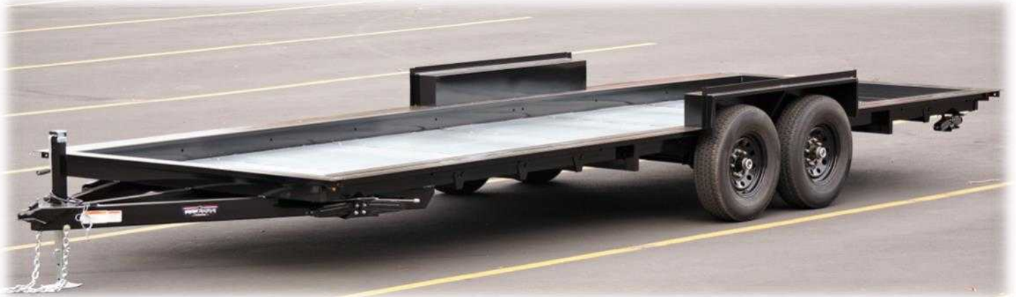
Pictured above is a PAD-14k24 equipped with optional Galvanized Bottom Pan, Fender Flashing, and Leveling Jacks

Our PAD series trailers are specifically designed as a foundation for a tiny house. Every detail of the frame is tailored for supporting a tiny house structure and its contents. For example, the crossmember supports are recessed 6" below the top of the frame to accommodate floor insulation without sacrificing floor height. This feature also minimizes contact of steel framework to the subfloor for a significant gain in thermal efficiency. Our PAD series isn't simply a modified flatbed trailer; it's designed from the ground up for one purpose only . . . to be the ultimate foundation for your tiny house.